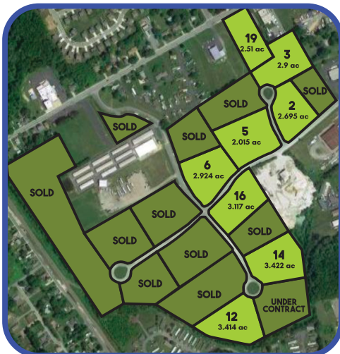
CENTRAL DELAWARE BUSINESS PARK - CHESWOLD - 23 ac