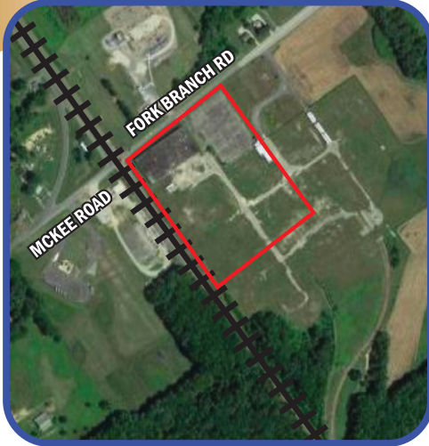
DOVER - 12 ac, 39,000 sf Warehouse

Here are some of the Properties Central Delaware has available for your business