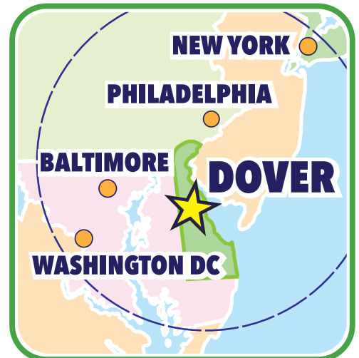
Located Within 4 Hours of 4 Major Cities