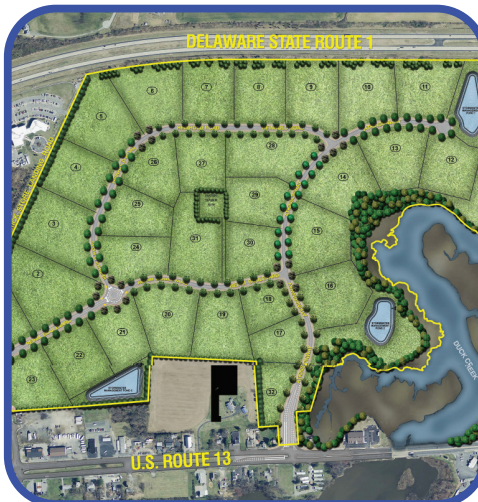
SMYRNA - 206 ac