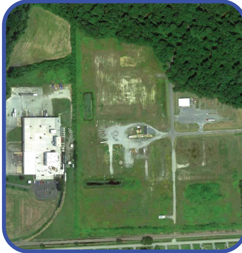
HARRINGTON - 130 ac Bldg 100,000 sf